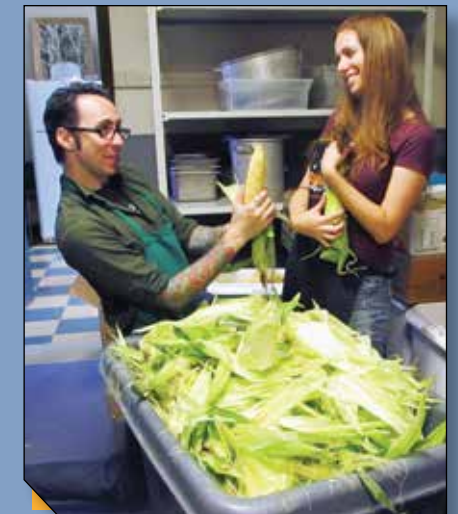
Swans Hotel & Brewpub staff help prepare lunch