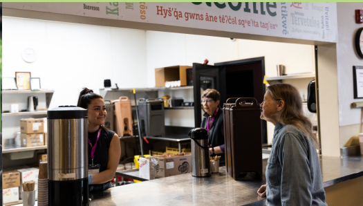
Nutrition bar at 919 Pandora Ave