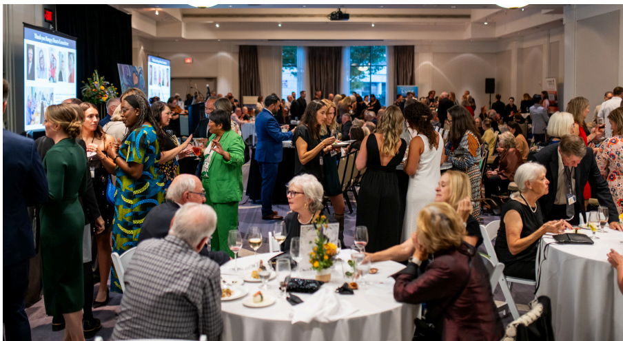
10th annual Hungry Hearts Gala

Our Place service users (our family members) regularly stabilize, return to work, and give back to the community after accessing our shelter, meals, medical, addiction recovery, and employment supports.