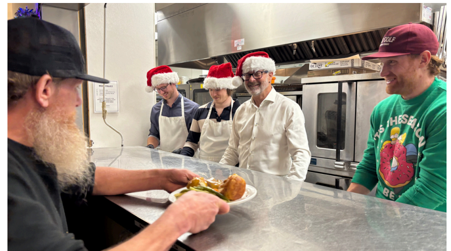
The Neal Estate Group Sponsor & serve a meal together